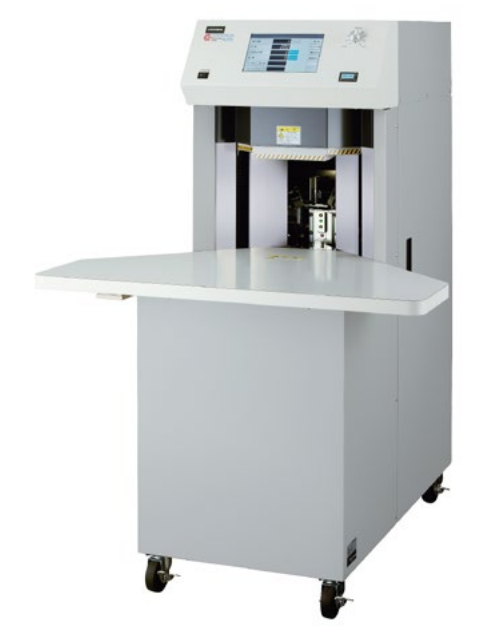
Unique counting mechanism prevents damages and corner bents on heavy digital stocks.