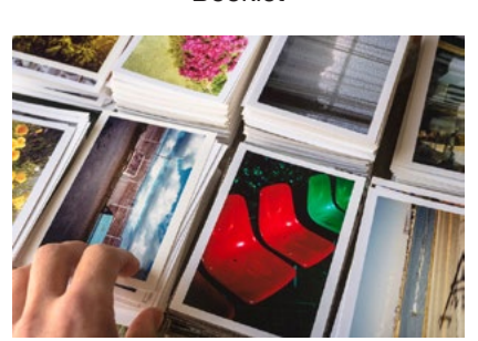
Digital print Photo card