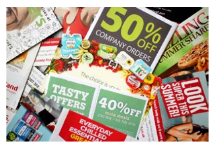
Flyer Direct mail