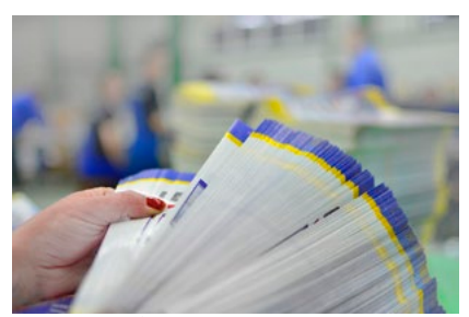
Commercial print Booklet