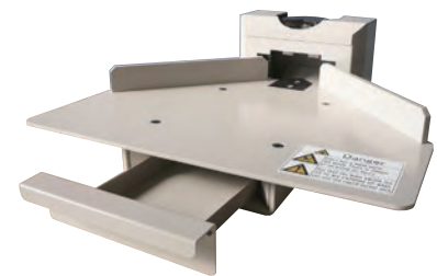
Round corner unit